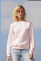
SOL'S SULLY WOMEN 03104